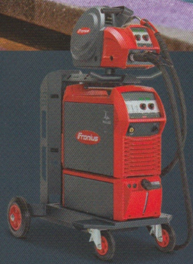
The Fronius TransSteel Pulse.

The pulse function of the TransSteel 3000 C Pulse, 4000 Pulse and 5000 Pulse permits faster welding speeds for thicker materials. The pulsed arc also reduces the amount of reworking required, as less welding spatter is generated.